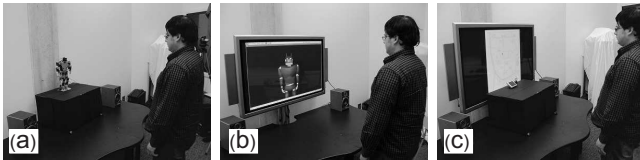
Figure 2: Snapshots of (a) Robot condition, (b) NUMACK condition, and (c) GPS condition